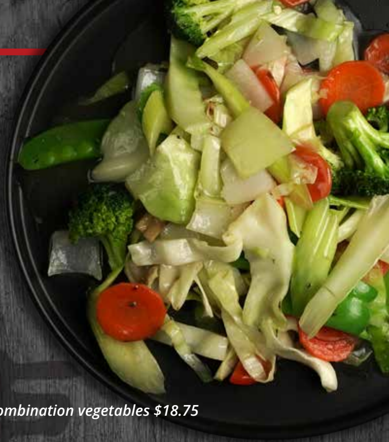
Combination vegetables $18.75