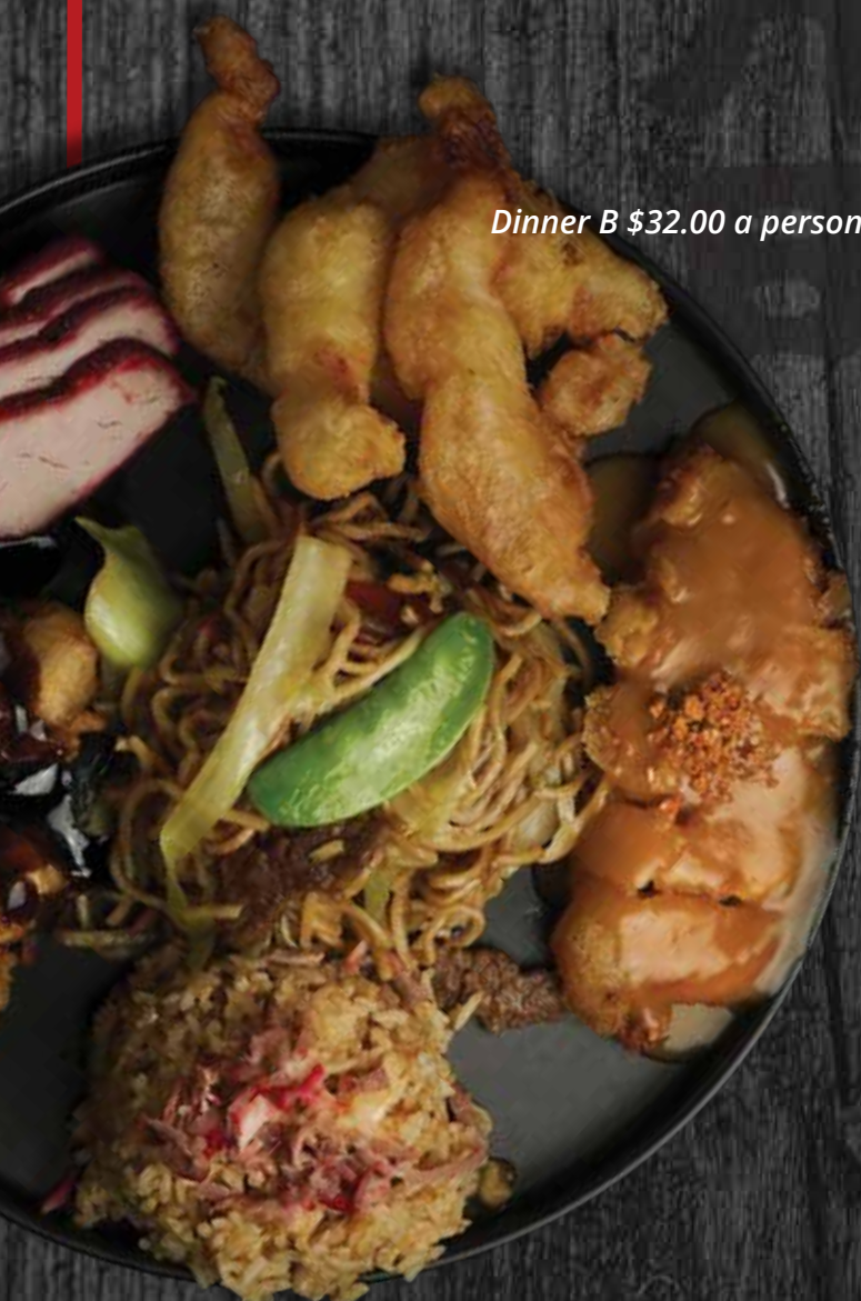
Dinner B $32.00 a person

Each item comes on it's own individual plates minimum two people