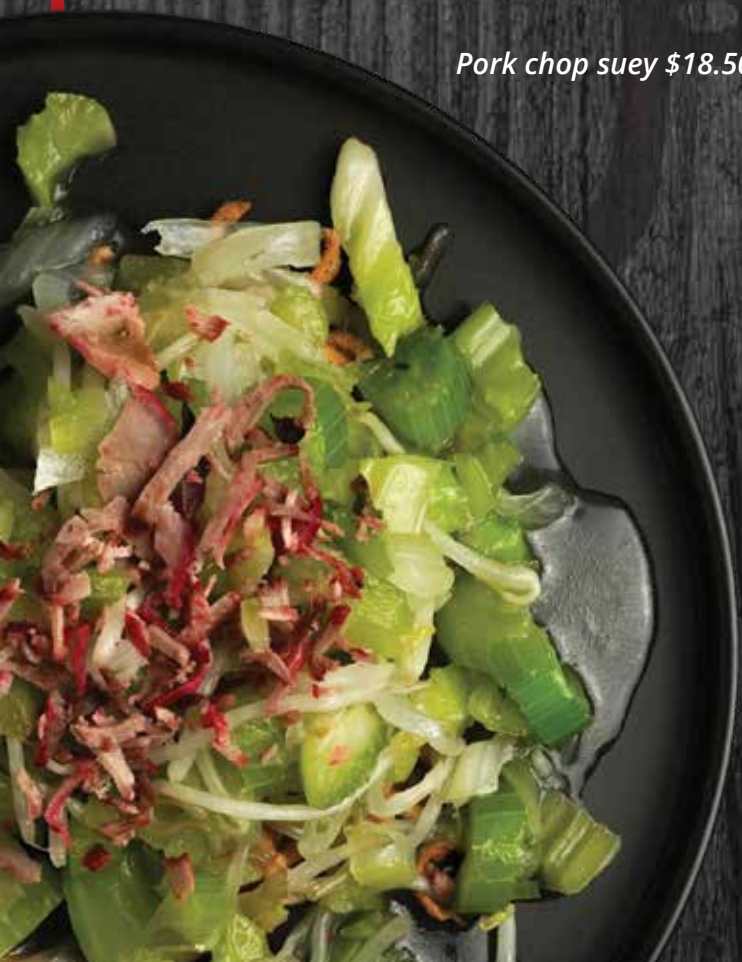
Pork chop suey $18.50