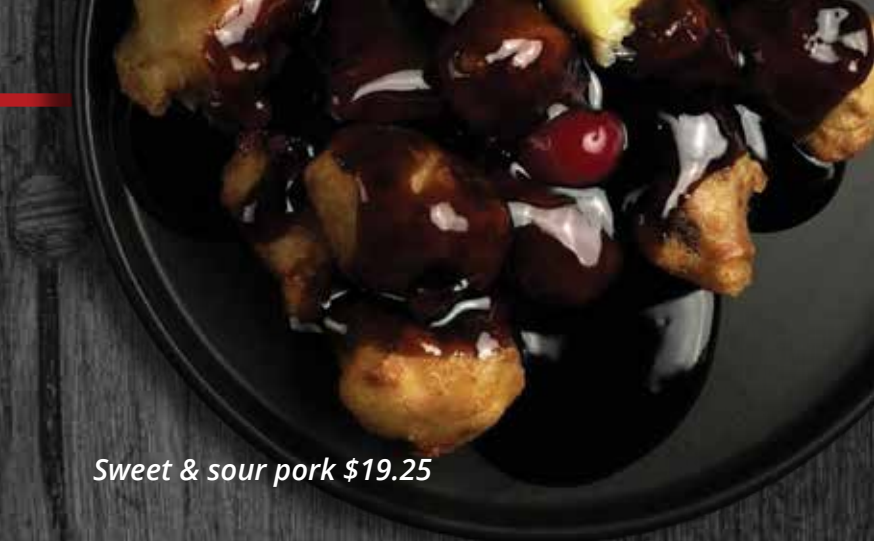
Sweet & sour pork $19.25