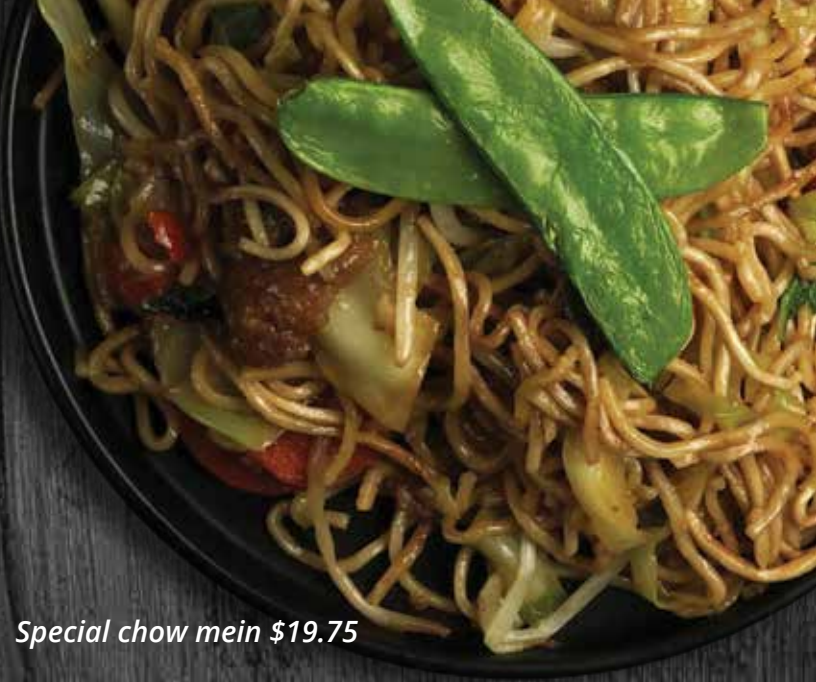
Special chow mein $19.75