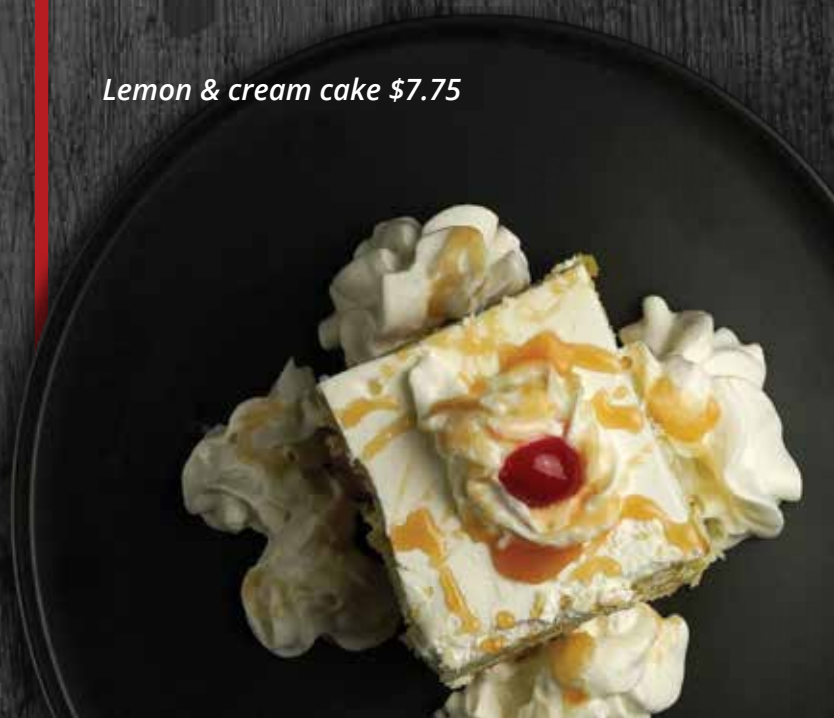
Lemon & cream cake $7.75